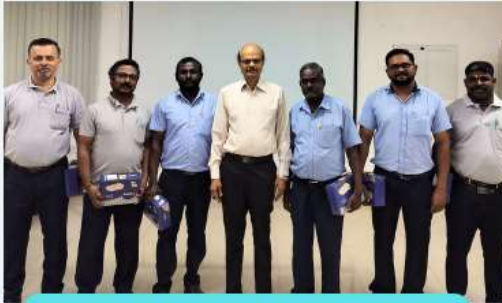
Valluvar QC Rings(PVD)