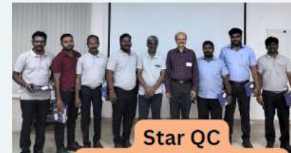
Star QC Tooling(Main Plant)