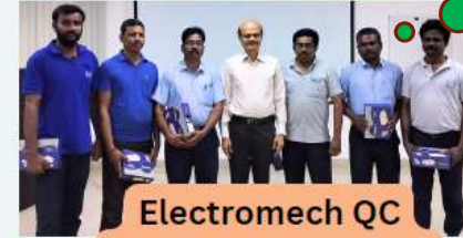
Electromech QC Rings(Maintenance)