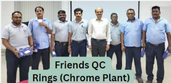
Friends QC Rings (Chrome Plant)