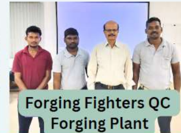
Forging Fighters QC Forging Plant

Congratulations on winning QC Presentation Category! We appreciate your remarkable team effort