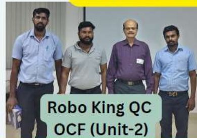
Robo King QC OCF (Unit-2)