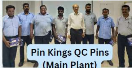
Pin Kings QC Pins (Main Plant)