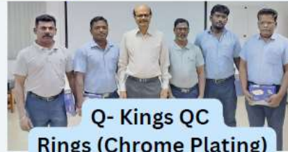
Q- Kings QC Rings (Chrome Plating)