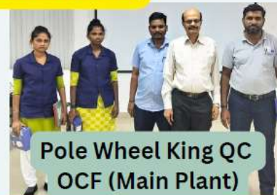
Pole Wheel King QC OCF (Main Plant)